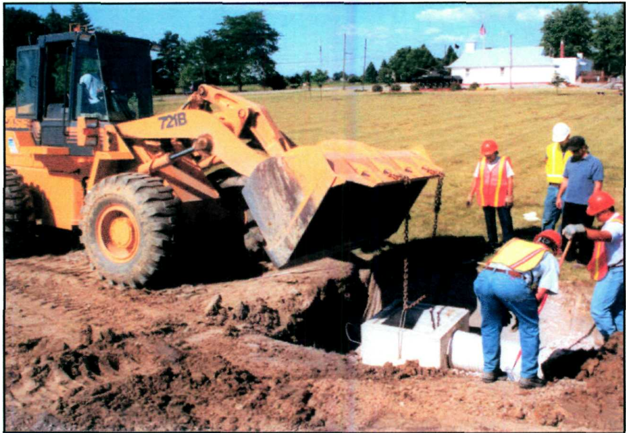
Oregon City workers are shown placing the storm sewer catch basin in position.

In late summer a 16 inch storm sewer was extended from Navarre Avenue South to the middle of the Post property along Wynn Road. The area south of the catch basin to Pickle Road has been graded to let surface water run to the catch basin and into the sewer line. The area was seeded. Rains have been scarce and there has been little opportunity to see if this system works.