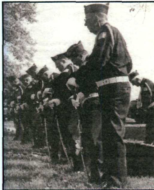
Dunberger Rifle Squad "cover" during a moment of prayer.