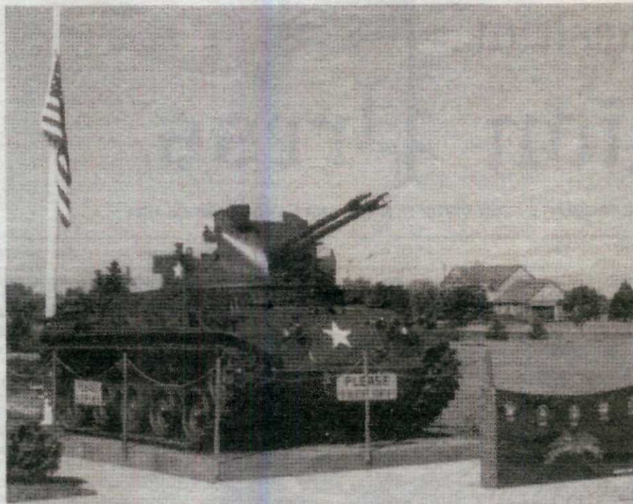
Our American flag at half staff behind the Post Memorial site after the attack on the World Trade Center and the Pentagon September 11, 2001.